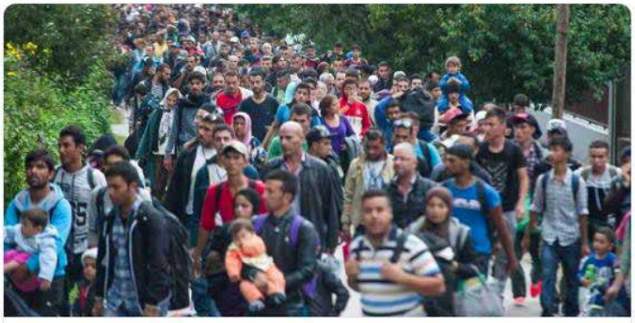
Der heimliche Einmarsch: Neuregelung des Familiennachzugs tritt heute in K... Der VOLKSAUSTAUSCH galoppiert! Im vergangenen Jahr stieg die Zahl der Menschen mit Migrationshintergrund in Deutschland um unglaubliche 4,4 Prozent... compact-online.de

The text above the link and picture reads: "While #Syria calls on its compatriots to return, in #Germany today (1.8.) the new regulation of #familyreunification comes into force: 'Refugees with limited protection status' will also be allowed to bring their relatives to Germany."